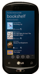
Windows® Phone 7